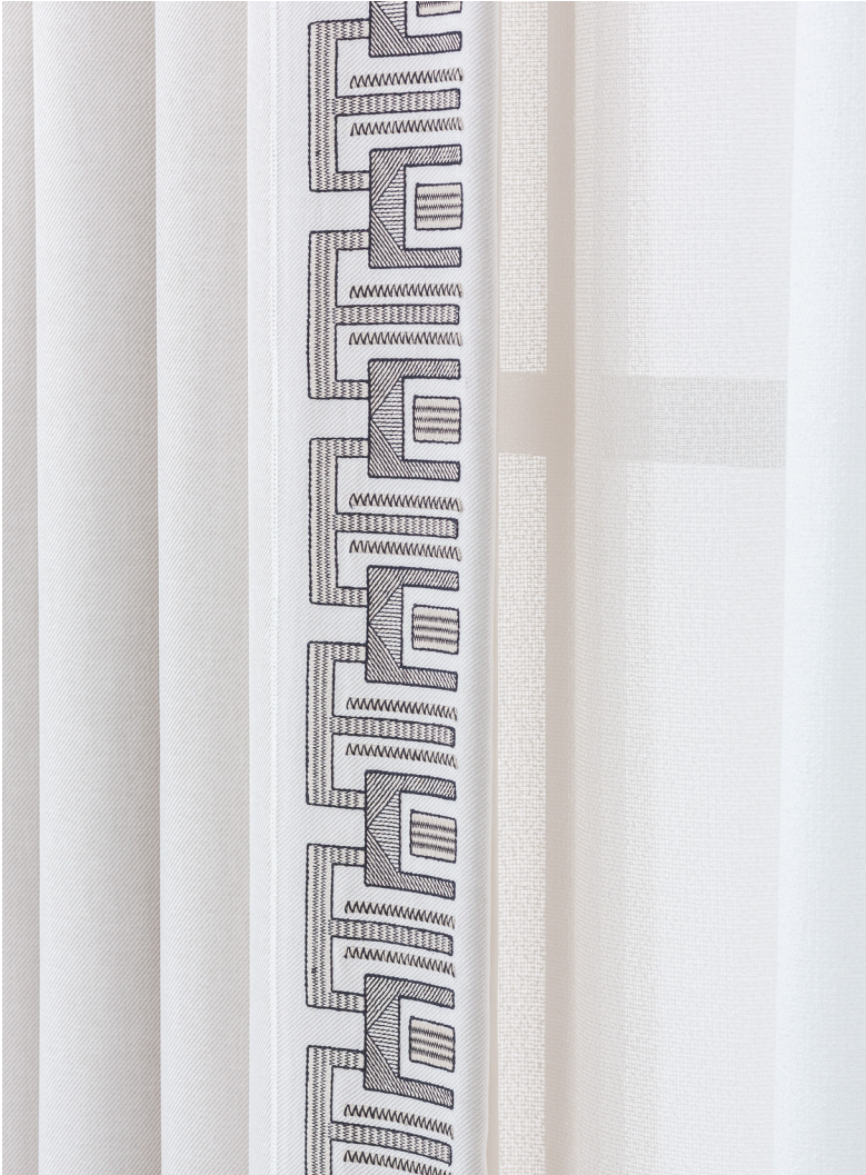
Above: VISION 05 CURTAIN SET color Variant: black/sand